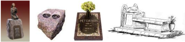
(cremation garden memorialization sampling)

Remember, once you've chosen cremation as a form of burial you have several appropriate and reverent options for the final place of rest in the Catholic Cemeteries of the Diocese of Joliet. The cremated remains of the body can be entombed in a mausoleum, inurned in a columbarium niche, inurned in a specifically designed cremation garden, or interred in a traditional ground burial space.